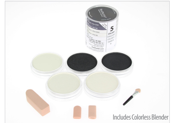
Mediums - Starter Set of 5 Ref. 30005

They have all the characteristics of PanPastel Colors, they are mixable, erasable, low dust, lightfast and professional artist's quality.