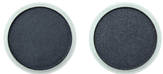
013 Pearl Medium - Black FINE Ref. 20013

TIP! If a pan surface (medium or color) becomes contaminated simply clean off with a clean sponge or paper towel. Watch this video: http://youtu.be/fNWP4x2fx4g