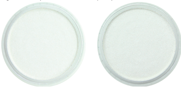
011 Pearl Medium - White FINE Ref. 20011