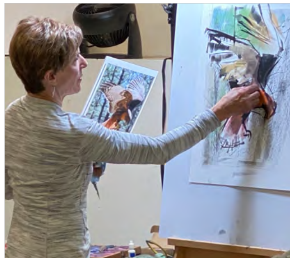
ONLINE VIDEO OF DAWN DEMONSTRATING WITH PANPASTEL: YouTube.com/PanPastel

PanPastel Colors are non-toxic and less dusty than stick pastels. They are easy to store, transport, and clean. With this set of 40 pans and a few applicators you should be able to mix virtually any color you wish, including metallics, pearlescents, shades and tints! You can even "dilute" any color by adding the Colorless Blender to it. PanPastel Colors are fun to use and don't require an easel or special "pastel" papers. Enjoy creating and combining colors as you would with paint. The color mixing chart enclosed is only to give you an idea of where to begin! Just play and discover what you can do!"