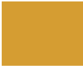
Yellow Ochre 844 • A Lightfastness: ***