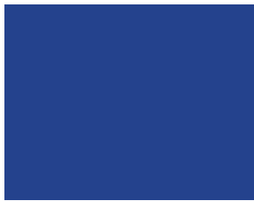
Cerulean Blue 818 • A Lightfastness: **