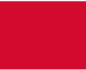
Permanent Red 810 • A Lightfastness: **