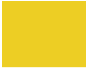
Yellow 804 • A Lightfastness: **