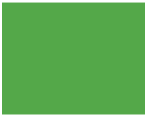
Yellow Green 836 • A Lightfastness: **