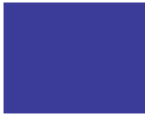
Cobalt Blue 819 • A Lightfastness: ***