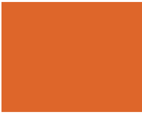
Orange 806 • B Lightfastness: ***