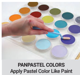
PANPASTEL COLORS Apply Pastel Color Like Paint

PanPastel Colors are pastel (dry) colors that can be mixed like paint & are ideal for experimenting with a limited palette.