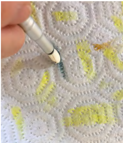
Using the tip of the applicator to remove excess Turquoise Shade onto the paper towel.