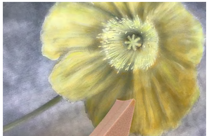
Using the edge of the Sponge Bar (Wedge) to add Titanium White to the highlights (the applicator can also be used to add white).