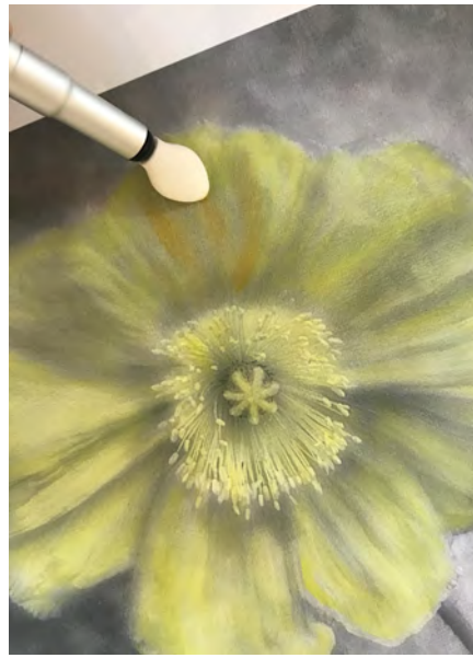
Layering Diarylide Yellow Shade over Hansa Yellow with the applicator. (This step is optional...it just gives the image a little more depth.)