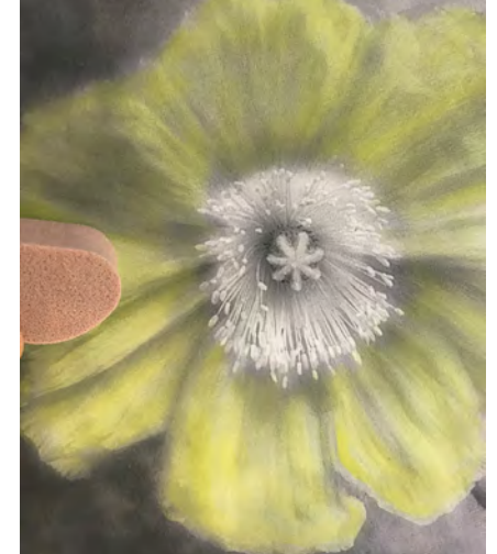
Using the sponge bar to blend color going from the inside of the flower to the edge.