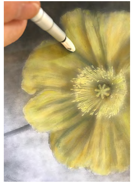
Applying Turquoise Shade in the shadow areas of the flower.