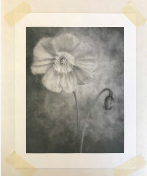
Black & white print taped on to the board. Original photograph by Dianne Poiniski - download & print: PaintDrawBlend.com/hand-coloring