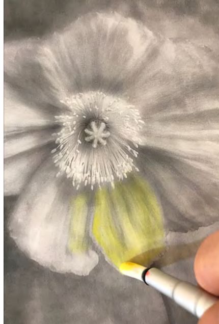
Using the tip of the applicator to carefully fill in color on the edge of the flower.