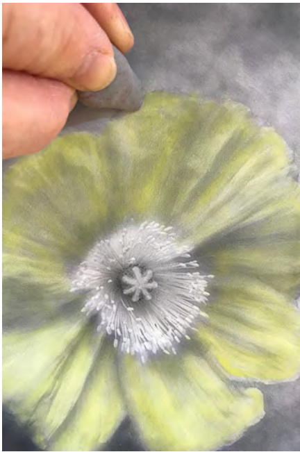
Using the kneaded eraser to remove color that may have been applied outside the edge of the flower.