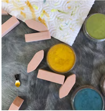
Materials list is provided on page 1.