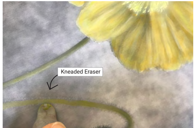
Gently erasing excess color with the kneaded eraser.