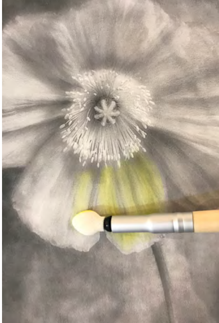
Applying Hansa Yellow with the applicator. Moving from the inside of the flower to the edge.