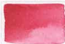
336 Quinacridone Red PV19 8 S NG ☐