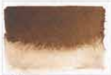
241 Transparent Oxide Brown PR101 8 S G □