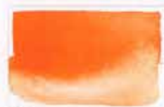
356 Deep Orange PO64 7/8 MS MG ☑