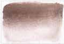
239 Caput Mortuum PR102 (earth pigment) 8 MS G □