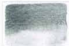
701 Vivianite (Blue Ochre) PB N/A (earth pigment) 8 NS G □