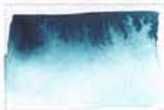
228 Transparent Turquoise PB15:3/PG7 8 HS NG