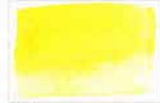
304 Aquarius Yellow PY168 7 MS NG ☑