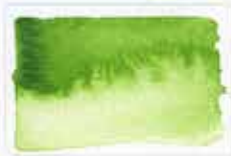
252 Sap Green Light PY110/PG7 7 MS MG