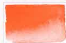
314 Brilliant Orange PO67 7 MS MG ☑