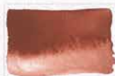
122 English Red Deep PR102 (earth pigment) 8 MS MG □