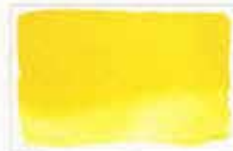
306 Cadmium Yellow Pale PY35 8 S NG ■