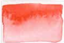
317 Scarlet Lake PR188 7 MS NG ☐