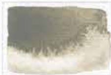
253 Aquarius Grey PBk6:1 8 NS G □