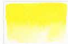
362 Quinophthalone Yellow PY138 7 S NG ☑