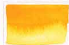
311 Permanent Yellow PY139 7/8 S NG ☑