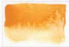
364 Chrome Orange (Hue) PB82 7/8 NS MG