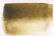
124 Cyprus Raw Umber Brownish PBr7 (earth pigment) 8 MS G □