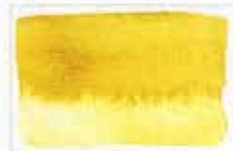
308 Nickel Azo Yellow PY150 8 MS NG ☑