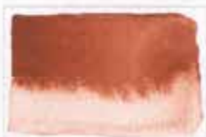
121 Venetian Red PR102 (earth pigment) 8 MS MG □