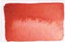
321 Quinacridone Scarlet PR N/A 8 NS MG ☐