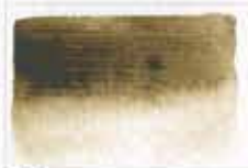
132 Cyprus Raw Umber Deep PBr7 (earth pigment) 8 MS G □