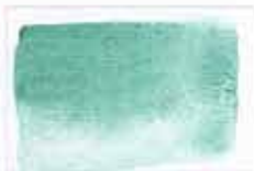
339 Viridian PG18 8 S G