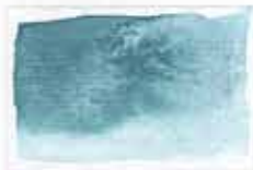
340 Cobalt Turquoise PB36 8 MS G