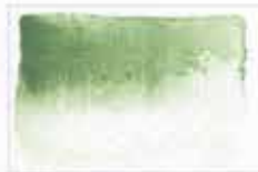
105 Green Earth PG23 (earth pigment) 8 MS NG