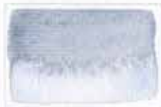
601 Lazurite (Lapis Lazuli) PB N/A (earth pigment) 8 NS G □