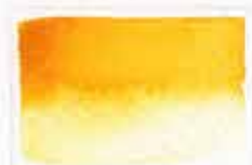
312 Isoindolinone Yellow Deep PY110 7 MS MG ☑