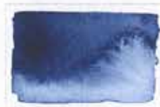
220 Indigo (Hue) PB60/PBk7 8 HS NG ■