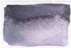
401 Przybysz's Grey PB29/PR177/PG26 7/8 MS G □