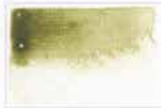
361 Glauconite PG23 (earth pigment) 8 MS MG