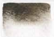
131 Van Dyck Brown NBk8 (earth pigment) 8 MS G □