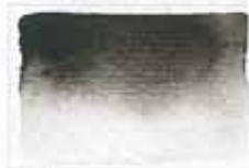
246 Vine Black PBk8 8 MS NG □