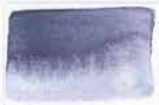
335 Shadow Violet Light PB36/PB29/PR176 7 S G □