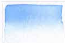
224 Royal Blue PW6/PB29/PB15:1 8 MS NG ■