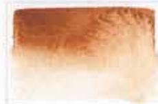
117 Pompeii Red PR102 (earth pigment) 8 MS MG □