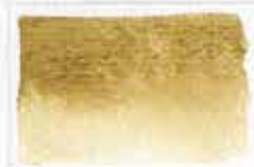
236 Transparent Oxide Yellow PY42 8 S G □