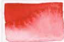
323 Naphthol Red PR112 8 HS NG ☐