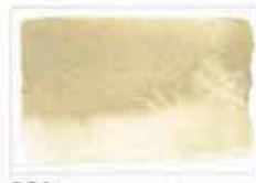
201 Buff Titanium PW6:1 (earth pigment) 8 NS G ■