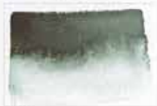
409 Perylene Green PBk31 8 MS NG