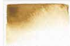
113 Ochre Havana PY43 (earth pigment) 8 MS MG □