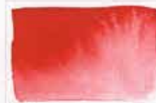
324 Pyrrole Red PR254 8 HS MG ☐