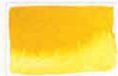
309 Cadmium Yellow Deep PY37 8 S NG ■