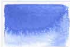
407 Cobalt Cerulean Blue PB36 8 MS G ■