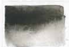
245 Ivory Black PBk9 8 S G □