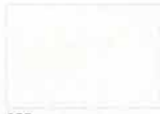
102 Titanium White PW6 8 MS NG ■