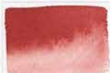
331 Perylene Maroon PR179 8 HS MG ☐