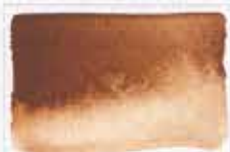
120 Italian Burnt Sienna PBr7 (earth pigment) 8 MS G □