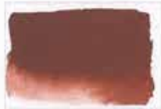
135 Indian Red PR101 8 MS G ■