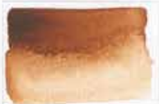
116 Veronese Red Earth PR102 (earth pigment) 8 MS MG □