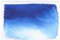
103 Phthalo Blue (Green Shade) PB15:3 8 HS NG □