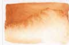
237 Mummy Transparent Red PR102 (earth pigment) 8 NS MG □