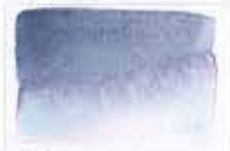
415 Misty Morning PG50/PV19 7 MS G □