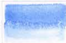
406 Cobalt Coelin Blue PB35 8 MS G ■