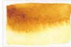
310 Quinacridone Gold PY150/PO48 8 S NG □