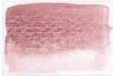
359 Potter's Pink PR233 8 MS G □