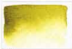
343 Deep Green Gold PY129 8 MS NG