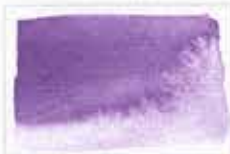
216 Manganese Violet PV16 8 MS G □