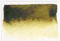
348 Olive Green Deep PY150/PBk9/PG17/PBr25 8 S G