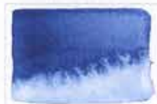
337 Indathrone Blue PB60 8 HS NG □