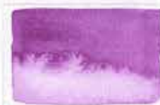
340 Quinacridone Purple PV55 8 NS MG ☐