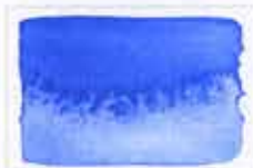
222 Ultramarine Blue (Green Shade) PB29 8 S G □