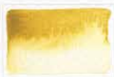
110 Transparent Gold Ochre PY43 (earth pigment) 8 MS NG