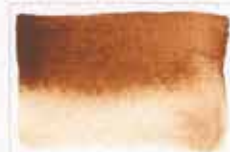
250 Burnt Sienna Monte Amiata PBr7 (earth pigment) 8 MS G □