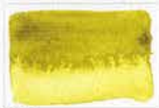
347 Green Gold PY150/PY129/PG36 8 S NG