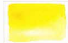
206 Hansa Yellow Medium PY74 7 MS NG ☑