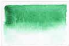
230 Phthalo Green (Yellow Shade) PB36 8 S NG