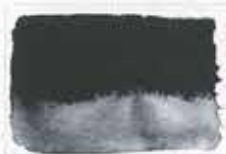
244 Neutral Tint PBk0/PBk6/PV19 8 MS NG □