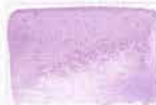
344 Ultramarine Pink PR259 8 MS G ☐