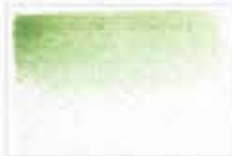
501 Malachite PG N/A (earth pigment) 8 NS G