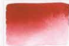
325 Azo Red PR144 7/8 S NG ☐