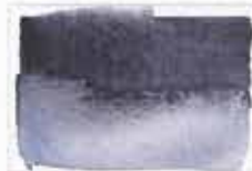
259 Shadow Grey PB29/PBr7/PV19 8 NS MG □