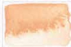
213 The Tint PWG/PY42/PR264 8 MS NG □