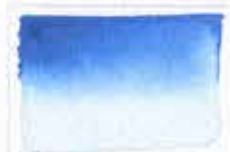
226 Blue Sky PW6/PB15:1 8 MS NG ■