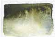
346 Aquarius Green PY150/PBr25/PB29 8 S G