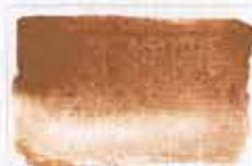
251 Aquarius Brown PBr11 8 MS G □