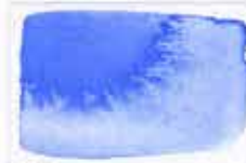
223 Ultramarine Light PB29 8 S G □