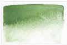
229 Chromium Green Oxide PG17 8 NS NG