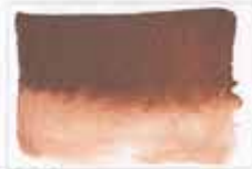
240 Hematite PR102 (earth pigment) 8 S G ■