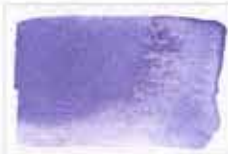
217 Ultramarine Violet PV15 8 MS G □