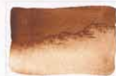
256 Blue Ridge Burnt Sienna PBr7 (earth pigment) 8 NS MG □