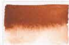
119 Terra Pozzuoli PR102 (earth pigment) 8 MS MG □