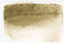
126 Cyprus Raw Umber PBr7 (earth pigment) 8 MS G □