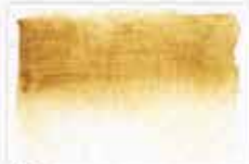
112 Italian Raw Sienna PBr7 (earth pigment) 8 MS MG □