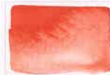
320 Cadmium Vermillion PR108 8 MS MG ☐