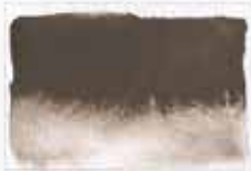
257 Manganese Brown PY164 8 NS G □