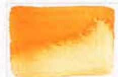
353 Golden Orange PO62 8 MS MG ☑