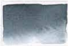
243 Payne's Grey PBk9/PB27/PR264 8 MS NG □