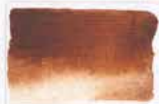
238 Transparent Oxide Red PR101 8 MS MG □