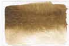
127 Cyprus Burnt Umber Light PBr7 (earth pigment) 8 MS G □