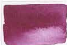
341 Quinacridone Violet PV19 8 S NG ☐