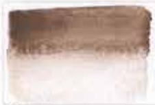
249 Hematite (Brown Shade) PR102 (earth pigment) 8 MS G □