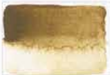
136 Dark Ochre PY43 (earth pigment) 8 NS G □