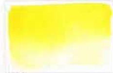
204 Lemon Yellow PY61 7 MS NG ☑