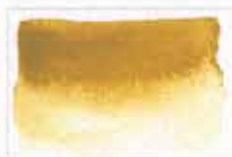
109 Gold Ochre PY43 (earth pigment) 8 MS MG