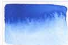
225 Phthalo Blue (Red Shade) PB15:6 8 MS NG □