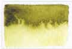
345 Olive Green Light PB29/PY129/PY150/PBr25 8 S G