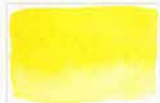
305 Aureoline (Hue) PY151 8 MS NG ☑