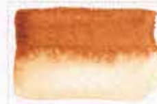
349 Quinacridone Burnt Sienna PO48 8 S NG □