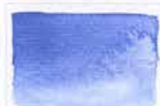
412 Aquarius Cobalt Blue PB72 8 MS G ■