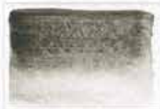
133 Roman Black PBk11 (earth pigment) 8 S MG □