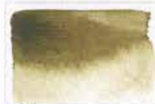
125 German Raw Umber Greenish PBr7 (earth pigment) 8 MS G □