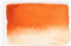
355 Transparent Pyrrole Orange PO71 8 MS NG ☑