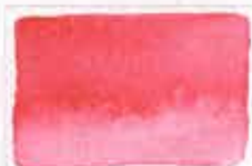
335 Cherry Quinacridone Red PR209 8 S MG ☐