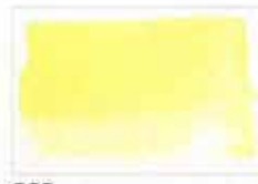
202 Nickel Titanate Yellow PY53 8 S NG ■