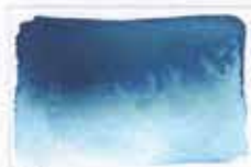
344 Ocean Blue PB24/PB15:3 8 S MG □