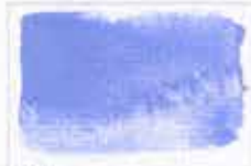
227 Lavenda PW6/PB29/PV16 8 NS NG ■