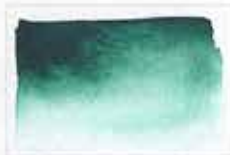
104 Phthalo Green (Blue Shade) PG7 8 HS NG