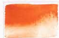
208 Benzimidazole Orange PO36 7/8 S MG ☑