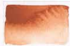
118 English Red Light PR102 (earth pigment) 8 MS MG □