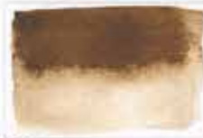
129 Brown Ochre PBr7 (earth pigment) 8 MS MG □