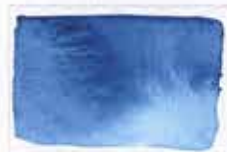
219 Prussian Blue PB27 8 S NG □