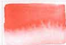
318 Anthraquinone Scarlet PR168 8 S NG ☐