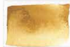
255 Blue Ridge Raw Sienna PY43 (earth pigment) 8 MS MG □