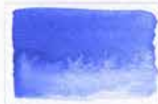
405 Cobalt Blue PB28 8 MS G ■