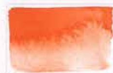
315 Cadmium Orange PO20 8 HS MG ■