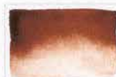
351 Transparent Brown PBr23 8 S NG □