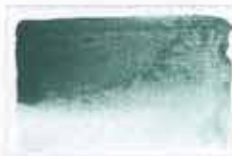
367 Cobalt Green Deep PG26 8 NS G