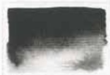
134 Mars Black PBk11 8 S MG ■