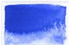
221 French Ultramarine PB29 8 S G □