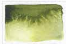
342 Hooker's Green PY150/PB27 8 S NG