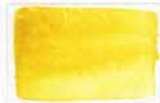
307 Indian Yellow (Hue) PY108 8 MS NG ☑