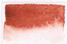
350 Quinacridone Maroon PR206 8 MS NG □