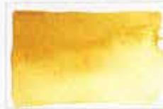
260 Quinacridone Gold (Hue) PR102/PY150 8 S MG □