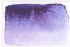
334 Mineral Violet PB29/PV19 8 MS G □