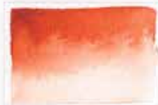
316 Pyrrole Orange PO73 8 S NG ☐