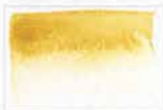
107 Venetian Yellow Earth PY43 (earth pigment) 8 MS NG