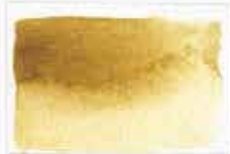
111 Veronese Yellow Earth PY43 (earth pigment) 8 MS NG □