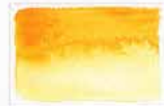
352 Golden Yellow PY181 8 MS NG ☑