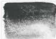
247 Aquarius Black PBk11 (earth pigment) 8 MS G □