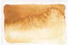
114 French Ochre PY43 (earth pigment) 8 MS MG □