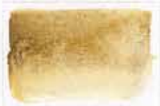
360 Goethite PBr7 N/A (earth pigment) 8 MS G □