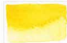
207 Hansa Yellow Deep PY65 8 S NG ☑