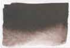
258 Iron Chrome Brown PBr29 8 NS G □