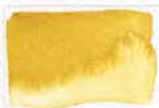
108 Natural Sienna Light PY43 (earth pigment) 8 MS MG