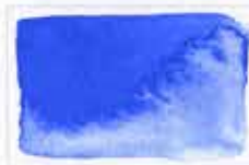
254 Ultramarine Intense PB29 8 MS MG □