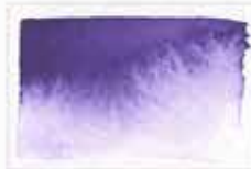
218 Dioxazine Violet PV37 8 S MG □