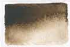
130 Cyprus Burnt Umber Deep PBr7 (earth pigment) 8 MS G □