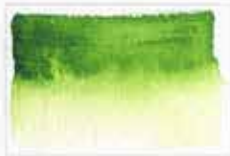
233 Sap Green PY150/PG7 8 S NG