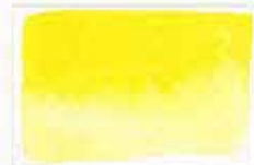
205 Benzimidazole Yellow PY154 7/8 S NG ☑