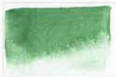
341 Cobalt Green Light PG50 8 NS MG