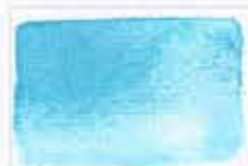
414 Cobalt Sea Blue PB28 8 MS G ■