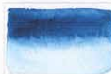
338 Phthalo Turquoise PB16 8 S NG □