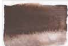
248 Hematite (Violet Shade) PR102 (earth pigment) 8 MS G □