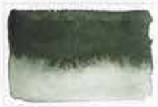
410 Perylene Green Deep PBk32 8 MS NG