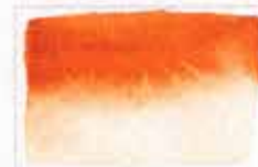
354 Aquarius Orange PO N/A 8 MS MG ☑