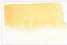
232 Naples Yellow Light PW6/PY53/PBr24 8 MS NG