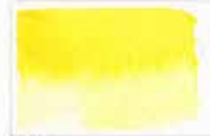
303 Isoindolinone Yellow Light PY109 8 MS NG ☑