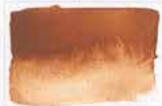
115 Red Ochre PR102 (earth pigment) 8 MS NG □