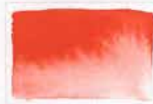
319 Pyrrole Scarlet PR255 8 HS NG ☐