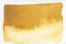
106 Yellow Ochre PY43 (earth pigment) 8 MS NG □