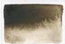
242 Sepia PBr7/PBk9 8 S MG □