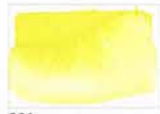
301 Cadmium Lemon PY35 8 S NG ■