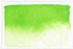
231 Permanent Green Light PY154/PG7 7/8 S NG