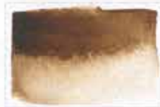
128 Cyprus Burnt Umber PBr7 (earth pigment) 8 S MG □