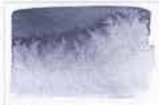
336 Shadow Violet PG50/PB29/PV19 8 S G □