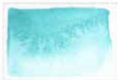
408 Cobalt Teal PG50 8 MS MG