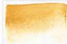
234 Naples Yellow Deep PBr24 8 S NG □