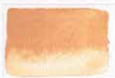
212 Naples Yellow Reddish PW6/PY53/PBr24/PR264 8 MS NG