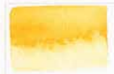
313 Permanent Orange PO59 8 S NG ☑