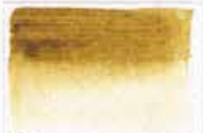
235 Natural Sienna Monte Amiata PBr7 (earth pigment) 8 MS MG □