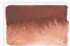
123 Mars Red PR101 8 S MG □