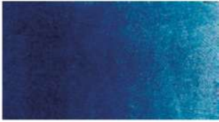
Process Blue (Cyan)

PB15:3 (C.I 74160) Beta copper phthalocyanine | PW18 (C.I 77220) Calcium carbonate Transparent Average drying BWS 7