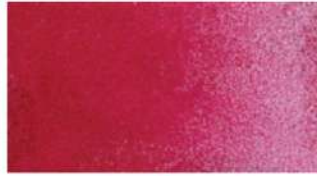
Process Red (Magenta)

PB15:3 (C.I 74160) Beta copper phthalocyanine | PW18 (C.I 77220) Calcium carbonate Transparent Average drying BWS 7