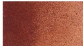
Burnt Sienna Hue

PY42 (C.I 77492) Iron hydroxide oxide Semi Opaque Fast drying BWS 8S 7